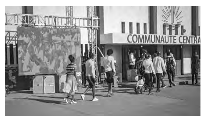
Whether in tents or in the churches, thousands attended the Pentecost festivities in Lubumbashi