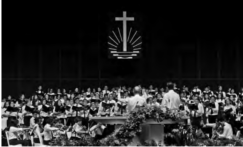
About 4,000 people attended the divine service in Jakarta, which took place in a theatre