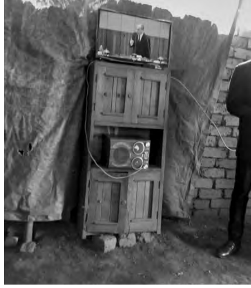
The divine service signal was picked up by the national TV broadcaster in the DRC

"The solution to connect people in our region continues to be the local TV stations," the District Apostle explains. And this is how it worked on Pentecost Sunday: