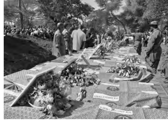
An estimated 8,000 to 10,000 mourners came to pay their last respects