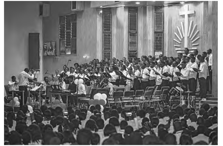
Pentecost celebration after the divine service