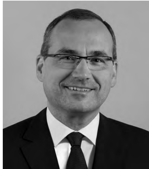
■ NAC International

If it brings me closer to the Lord, then I will walk this path and accept this new knowledge. If it does not correspond to the will of God, then I do not want this new thought.