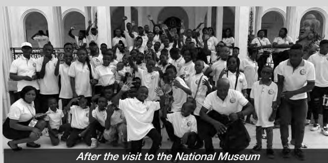
After the visit to the National Museum

More than two hundred young people and their supervisors from the different districts of French-speaking Cameroon gathered from August 11 to 14, 2022, in Ekounou congeration in Yaoundé for the biennial Youth Convention. The central theme, "Youth, engine of development of the church", was based on 1Tim 4:12 "Let no one despise your youth..." It was deepened by further contributions concerning