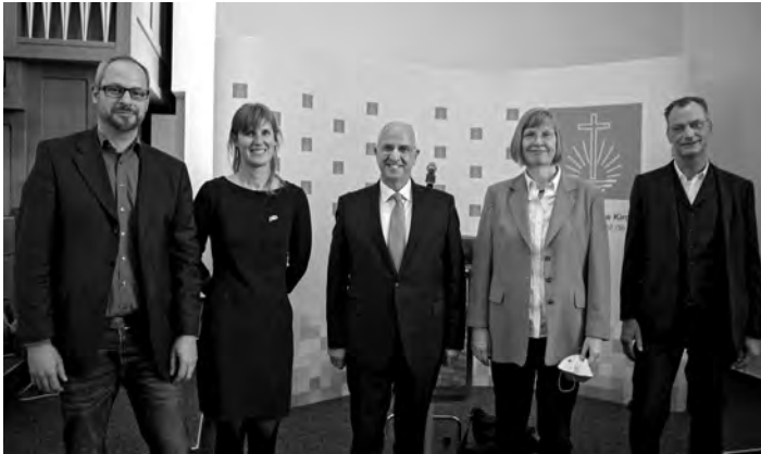
Representatives of the Council of Christian Churches in Germany