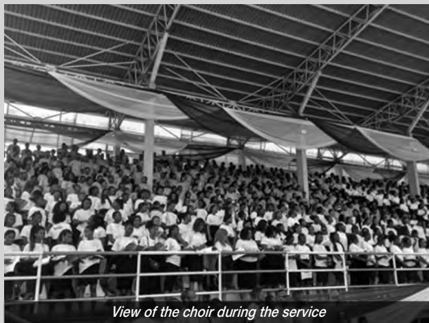
View of the choir during the service