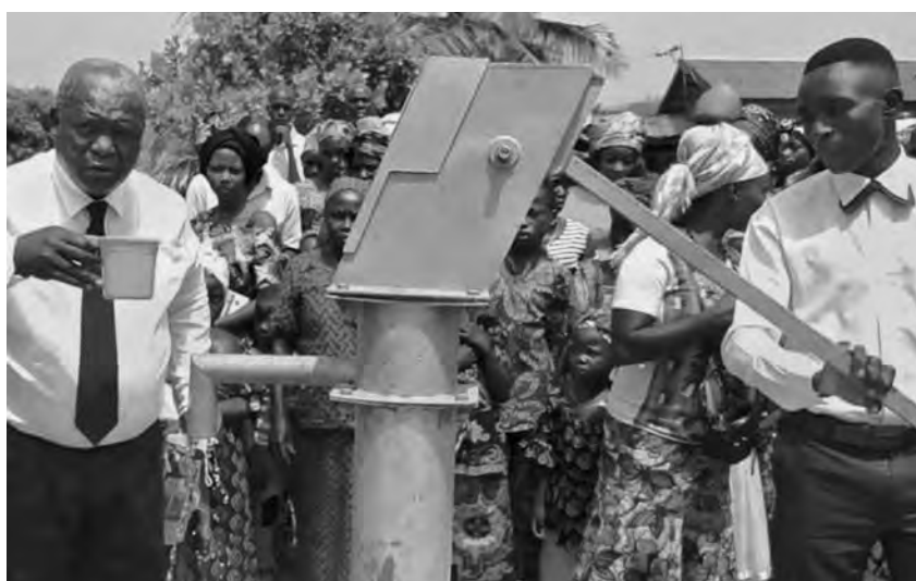
■ NAC Sierra Leone

...you see so many situations in which people need help. No matter if many or only a few look more closely, the help is gratefully accepted: in Ukraine, in Sierra Leone, and in the Philippines.