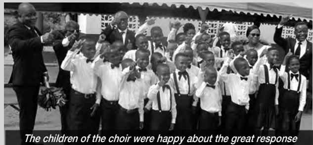
The children of the choir were happy about the great response

The children's choir had the same performance time and number of songs as all the large choirs. This delighted everyone and the children were very proud to be honoured in this way alongside the large, nationally known choirs.