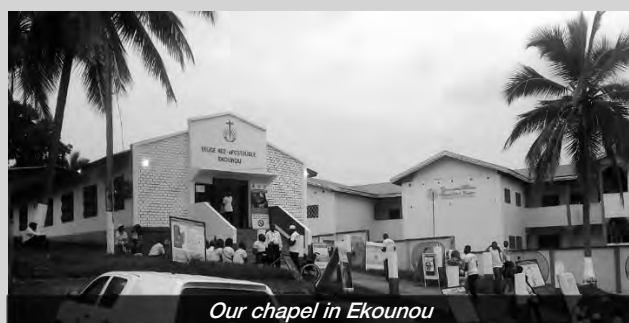
Our chapel in Ekounou

The divine service for the youth, officiated by the Apostle Félicien Ebanga Edoa, marked the end of the Youth Convention 2022.