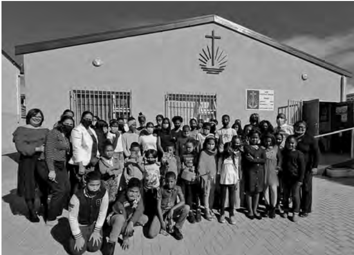
■ NAC Cape Town