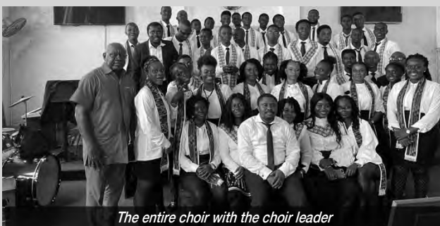
The entire choir with the choir leader