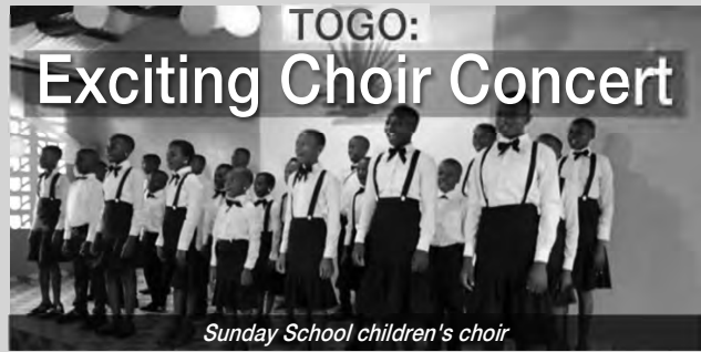
Sunday School children's choir