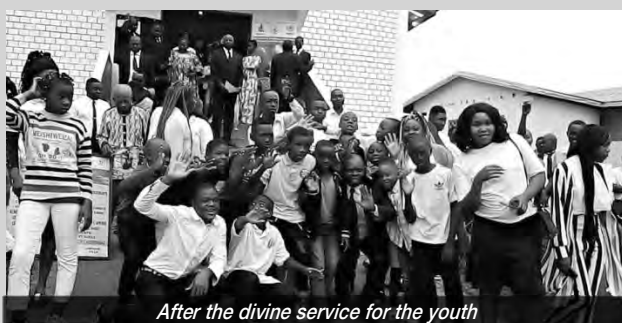
After the divine service for the youth