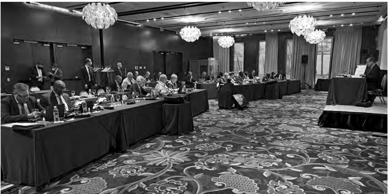
The District Apostles met in Buenos Aires over Pentecost for their semi-annual conference

“I am very grateful for this step,” he confessed after the vote. He said that it had been a concern of his for some time to share his leadership of the Church particularly in financial matters, which are linked to his ordination as Chief Apostle, with an elected board of directors.