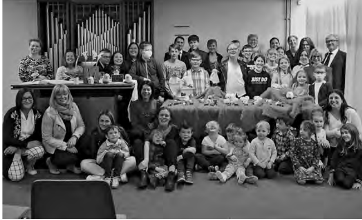
■ NAC France

After the children's service in Algrange in France in May everyone posed for this picture