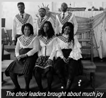
The choir leaders brought about much joy

This display of musical talents; not only adores God but adds to faith development, joy and amusement of congregants.