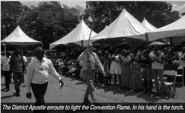
The District Apostle enroute to light the Convention Flame. In his hand is the torch.

of choirs from the different districts at Place de la Concorde on Saturday afternoon that greatly delighted the young people. These days of rejoicing and warm atmosphere in Port-Gentil, the "economical capital", were closed by the divine service for the youth on Sunday, 28.08., celebrated by the Lead Apostle Nwogu. → See also: www.ena-gabon.org