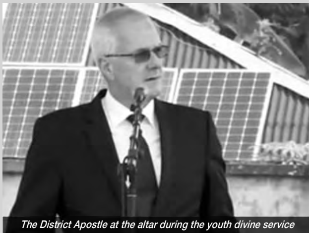
The District Apostle at the altar during the youth divine service

With many impressions and great enthusiasm, the young people started their journey home on Sunday afternoon. The hope and anticipation for the next great Youth Day is in every participant.