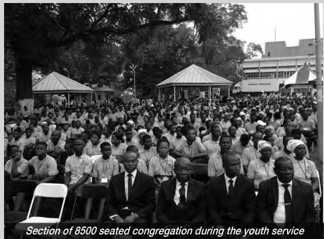
Section of 8500 seated congregation during the youth service