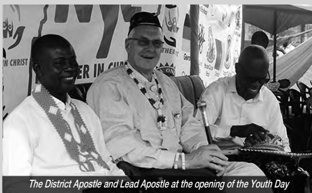
The District Apostle and Lead Apostle at the opening of the Youth Day