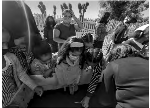
Children of the Woodlands congregation in Cape Town launch their planting project "My little garden"

The name of the initiative is "Music with Children. How to go about it after Covid?" Choir directors, as well as anyone who enjoys making music with children, can register on the online training portal of the New Apostolic Church Western Germany. During the training, participants will be made familiar with the teacher's folder for the German children's songbook Stimmt mit ein , will learn voice training stories, and how to make instruments themselves and then incorporate them. Music is an important aspect of religious education, supports personality development, and promotes fellowship.