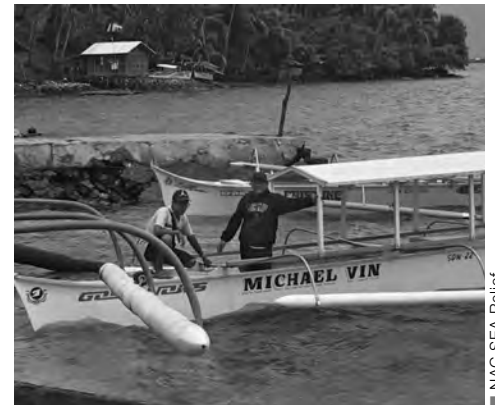
NAC SEA Relief