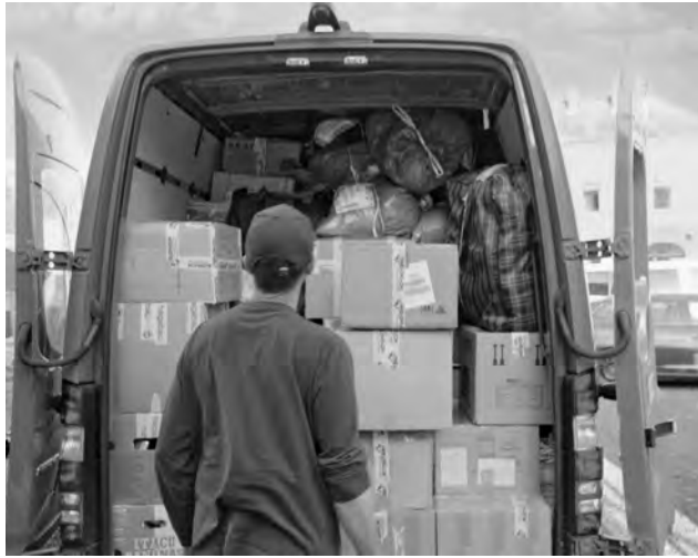
A van full of donations for Ukraine

Helpers in Plauen sort through the donations and repack them