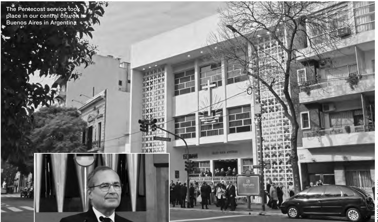
■ NAC South America

The Pentecost service took place in our central church in Buenos Aires in Argentina