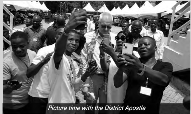
Picture time with the District Apostle