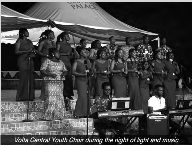
Volta Central Youth Choir during the night of light and music

name "Kwame", meaning "male born on Saturday". Among other interesting events were the cultural procession of all 15 Apostle Areas and the colourful Night of Light & Music, where the invited brothers and sisters from Nigeria sang in a Ghanaian language. The Youth also interviewed the District Apostle about his life and the church. The zenith of it all was the Divine Service with the District Apostle on Sunday.