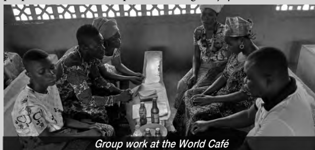
Group work at the World Café

Various activities helped to strengthen the joy of faith among the young people. From parades to sporting activities and group work, the participants were able to get involved with enthusiasm. The divine service was the highlight of the meeting. The young people returned to their parishes with great joy.