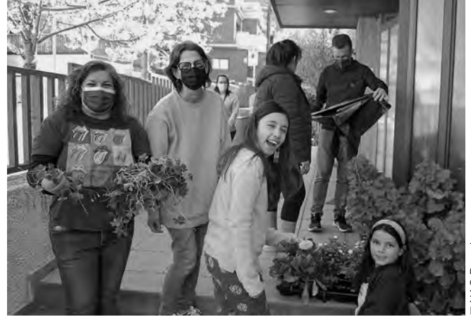
■ NAC Barcelona

Children in Barcelona in Spain planted ornamental and edible plants in the church garden in April this year