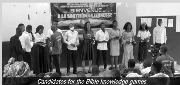
Candidates for the Bible knowledge games

The youth outing took place on Monday 17th April 2022 at the University of Conakry. 927 youth from the districts of Conakry and Sanoyah took part. The young people first dealt with two spiritual topics: the role of young people in our church and living together in marriage. The participants could then experience many activities: performances of various choirs, demonstrations of musical instruments (melodica, organ, etc.), games on the subject of Bible knowledge and finally sports activities (running, mouse hunting and football).