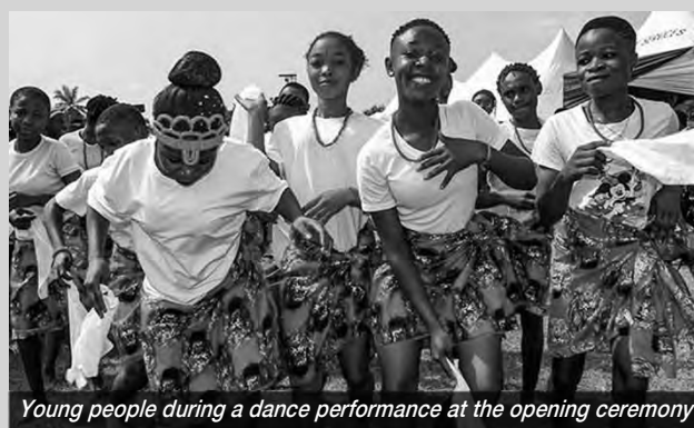
Young people during a dance performance at the opening ceremony