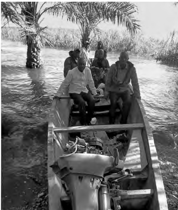
■ NAC Congo South-East