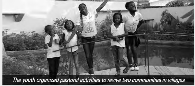
The youth organized pastoral activities to revive two communities in villages

A guest service, organized by mothers in Libreville and Port-Gentil congregations, was held for the community folks so they can also be saved by our Lord Jesus.