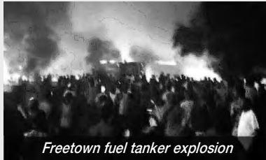
Freetown fuel tanker explosion

Every Sunday, the Chief Apostle and District Apostle dispends the Holy Communion for departed souls; they should also be able to have fellowship with Jesus Christ. We always pray for the unredeemed so that in the divine service for the departed they also experience redemption and death is not the end of all future. Our goal is to be ready when the Lord Jesus Christ returns - our future!