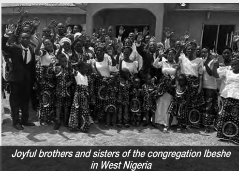
Joyful brothers and sisters of the congregation Ibeshe in West Nigeria

With our future assured in Christ, church activities in Nigeria remained active in the circle of the children, youths, choir, men and women fellowships.