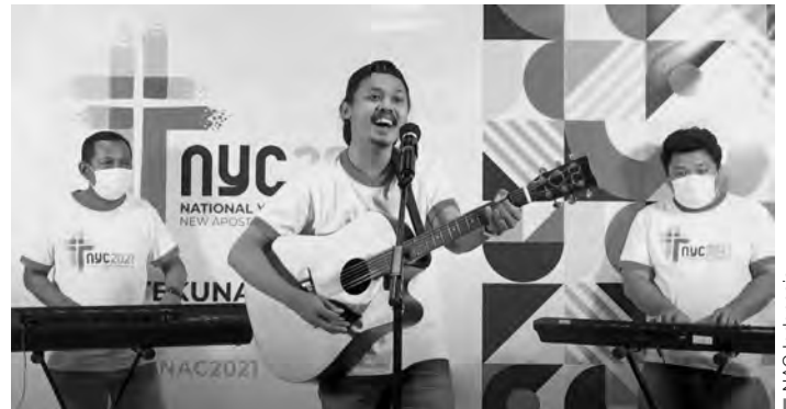
Although the National Youth Day in Indonesia could only take place online, the participants had a lot of fun