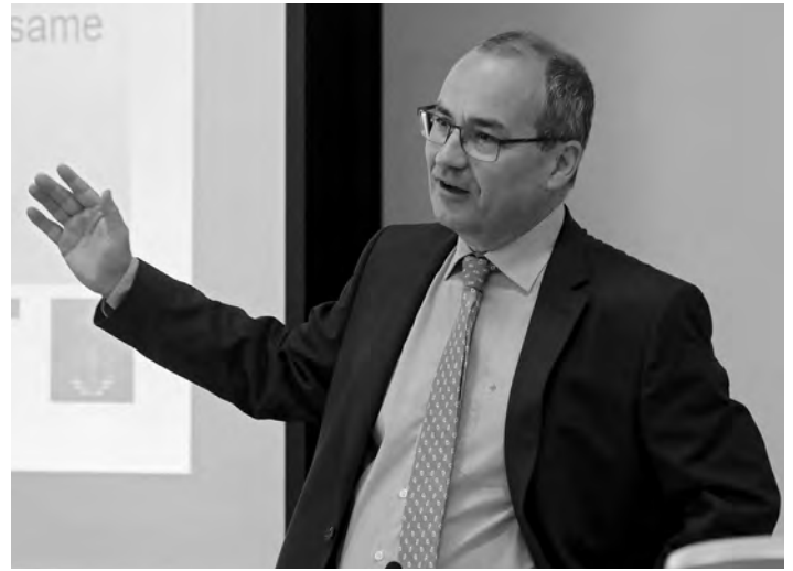
The District Apostles discuss the ordination of women