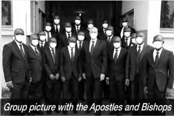
Group picture with the Apostles and Bishops