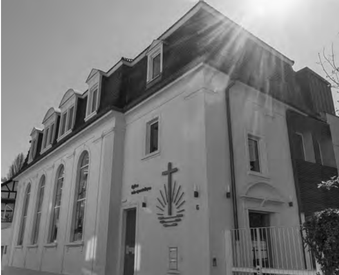
The divine service for the brothers and sisters in parts of South America was held and broadcast from our church in Strasbourg, France

applies to the brothers and sisters in South America: despite all kinds of difficulties, illness, great economic hardship, in spite of violence and crime they remain faithful to the Lord. "I would like to make something clear: I really admire that and have great respect."