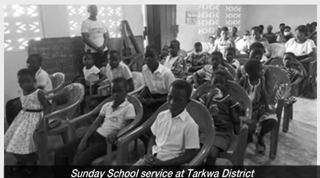
Sunday School service at Tarkwa District

The motto has been very timely, especially in these times of COVID-19 where businesses and life almost came to a standstill.