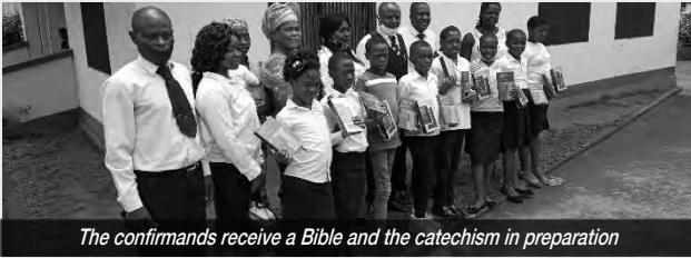
The confirmands receive a Bible and the catechism in preparation