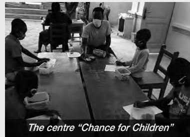
The centre "Chance for Children"

On Saturday morning the District Apostle visited the "Chance for Children" day centre for street children in Accra, which has been financially supported by the relief organisation of the New Apostolic Church of Southern Germany for some time.