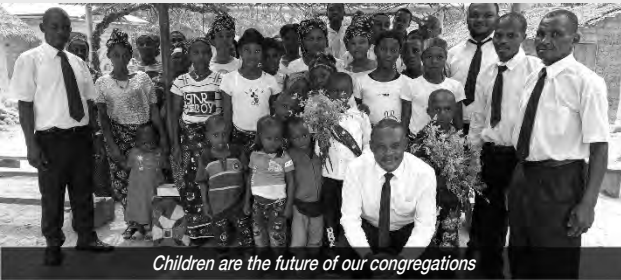
Children are the future of our congregations

This “spiritual investment” in the future of the young brothers and sisters will also help them to prepare themselves for the return of Christ – our common future!