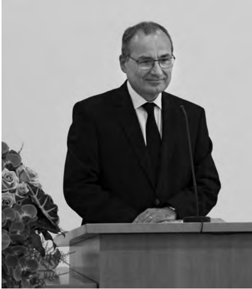
A small congregation gathered in Zurich