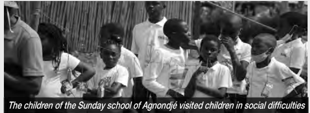
The children of the Sunday school of Agnondjé visited children in social difficulties