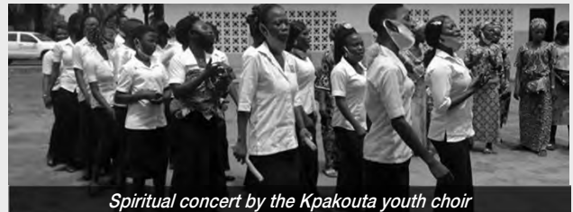
Spiritual concert by the Kpakouta youth choir

Accordingly, 'Christ is our future' was the theme under which various activities were organised.