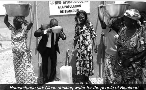
Humanitarian aid: Clean drinking water for the people of Biankouri

The Church has also provided other localities with other basic social amenities in recent times.