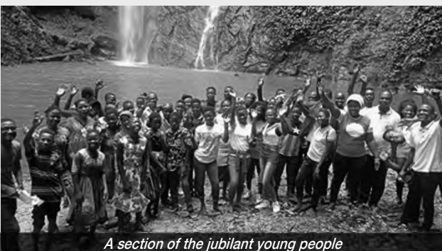
A section of the jubilant young people