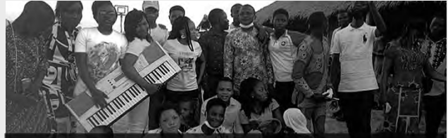
Young people rejoice at the beach meeting with Apostle Olou