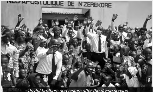
Joyful brothers and sisters after the divine service