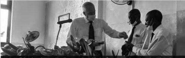
District Apostle dispensing Holy Communion for the dead