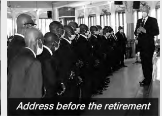
Address before the retirement