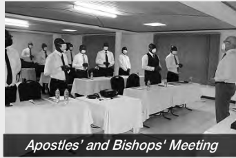
Apostles' and Bishops' Meeting